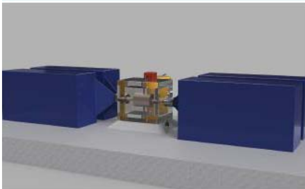
Stabilized Liner Compressor