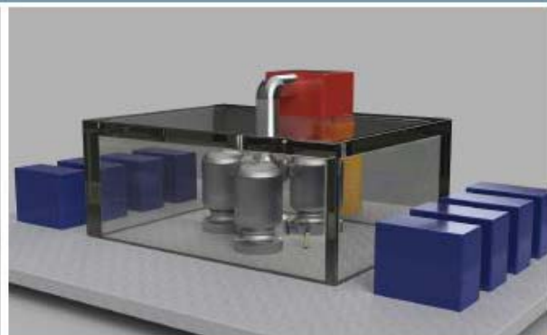
Sheared Flow Stabilized Z-Pinch